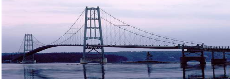
FIGURE 2. The Deer Isle Bridge.

More generally we may consider a force h satisfying the following assumptions: